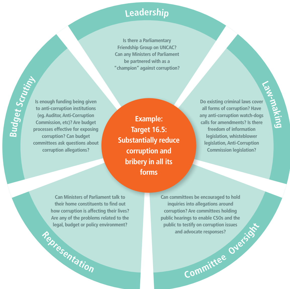
Figure 2: Example entry points for working with legislators

Although laws and amendments are commonly drafted by the executive branch, in many countries, members of the legislature can also propose their own laws (whether because the congress/assembly has its own law-making powers or through private members' bills). Where this is possible, individual legislators and/or coalitions of legislators could also be encouraged to develop draft laws. When legislators who are willing to sponsor a law or amendment are identified, civil society can provide them with technical assistance to put together a draft law. In